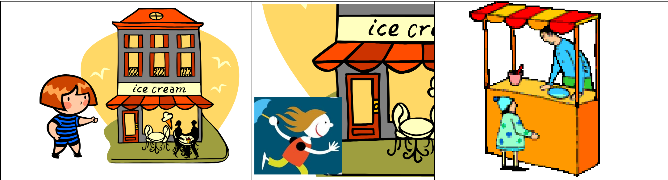
小女孩 看到 冰淇淋店